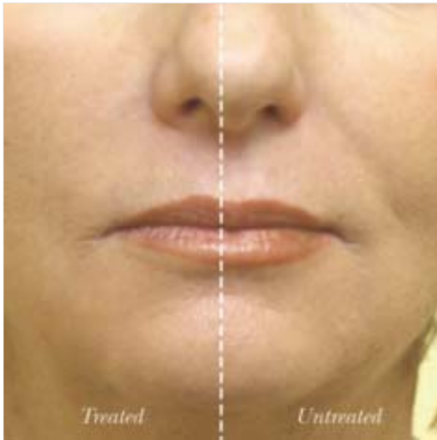
Figure 2. Split screen view demonstrates patient before and immediately after 1 treatment combining IR and bipolar RF energies.

CAP energy can penetrate up to 400 \mu\text{m} , where most sun damage occurs. 4 Healing after treatment with the Affirm is rapid, and collagen remodeling is stimulated in the uncoagulated tissue, as well as in the coagulated columns, a benefit supported by histologic studies. 57,61