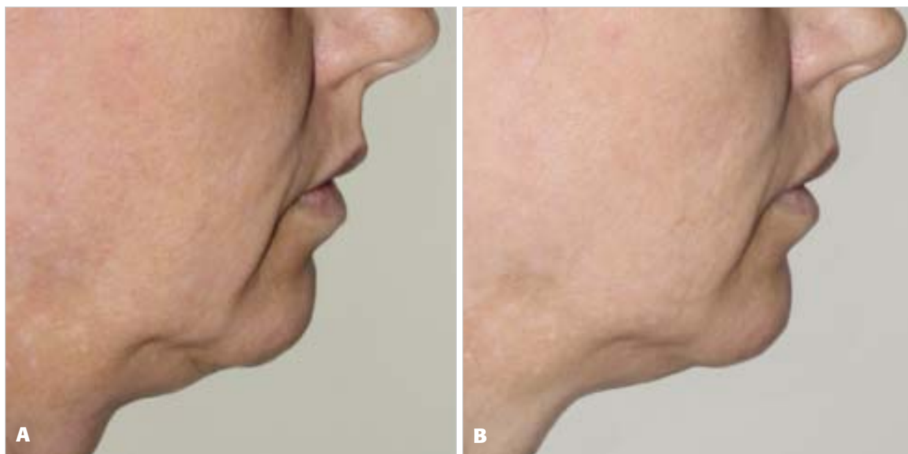
Figure 1. A , Pretreatment view. B , Posttreatment view 1 month after treatment with a device combining IR and bipolar RF energies.

In solar elastosis, bundles of loosely packed collagen 58 are present in the dermis at depths of 100 to 400 μm. 59,60